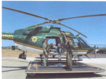
Pat and Rylie practicing hot and cold loads on the helicopter, all while training for CALEMA Certification.

You're almost there now Pat and Rylie – we're all very proud of you!