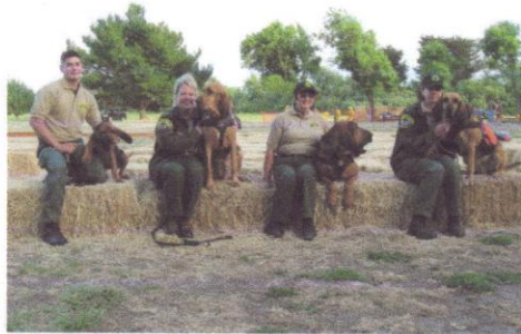
Sonoma SAR team members at the Cub Scout Camp.