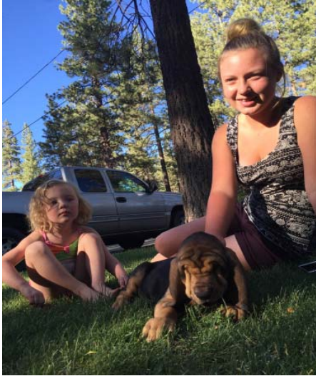
McGuire's California Girl aka "Marla Hooch"