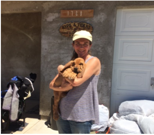
McGuire's Lil Surfer Girl