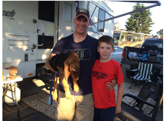
McGuire's Somewhere on the Beach